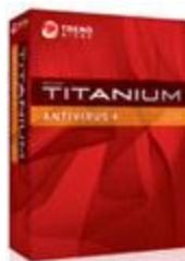
Titanium™ Antivirus+ 1Yr 1PC