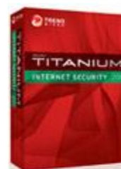
Titanium™ Internet Security 1yr 3pc