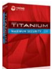
Titanium™ Maximum Security 1 yr 3PC