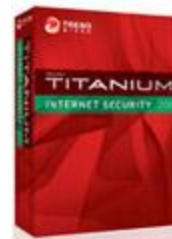
Titanium™ Internet Security 1yr 3pc