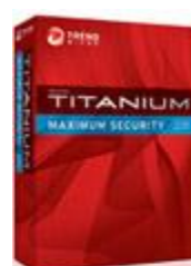
Titanium™ Maximum Security 1 yr 3PC