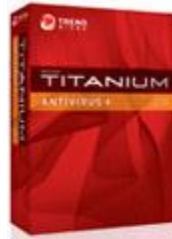
Titanium™ Antivirus+ 1Yr 1PC